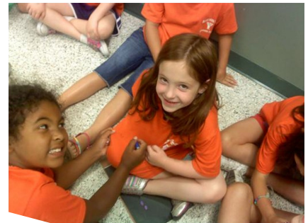
BUMBLEBEES BUZZING IN THE HALLS OF THE Y

Please remember to pack your daughter a lunch that they will like! Many complain that they don't like the food that they are given. Also, please label your daughter's orange shirts as they get mixed up easily in the changing rooms. Thank you!