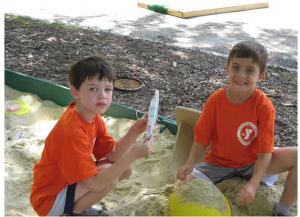
SCENES FROM THE SANDBOX